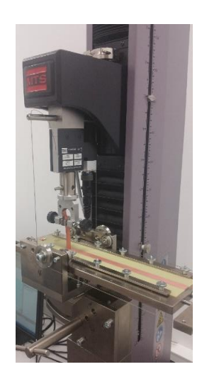
Fig. 2: Experimental pulled at constant velocity.