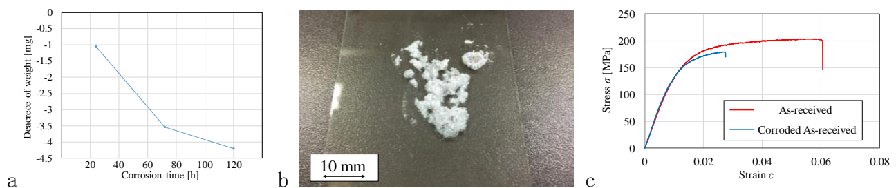
Figure 3: (a) The decrease of weight of As-received,(b) Corroded Mg/Ti, (c) The stress-strain curve of As-received.

In Fig. 3 It was shown that the decrease of the weight of As-received and Mg/Ti (Fig.3(a)), an image of corroded Mg/Ti (Fig.3(b)), and the stress-strain curve of As-received before and after the corrosion test (Fig.3(c)). The decrease of the weight of 72h was 2.49 mg more than that of 24h. The decreased weight with 120h was 0.66 mg and less than that of 72h. We confirmed the specimen had Na on its surface according to XRD analysis, which was included in the solution, i.e., Saline. It seemed that component of the solution was coated during the corrosion progress. This Na might suppress the loss of the weight even though the corrosion. On the other hand, Mg/Ti completely dissolved after 24h due to the corrosion (Fig.3(b)). The corrosion potential between Mg and Ti is 1.6V [4] and that caused the dissolution of Mg and Ti. In the mechanical test, Fig.3(c) indicates that the stress and strain of As-received decreased 21.5 MPa and 0.311 \epsilon with corrosion, respectively.